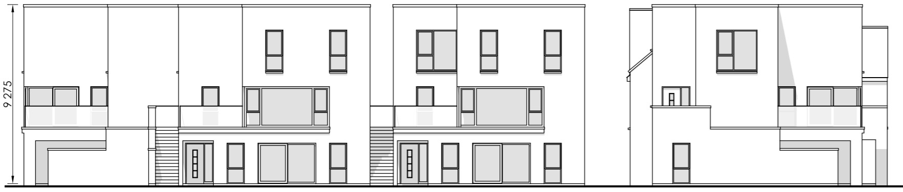
Side [South] Elevations Scale 1:200