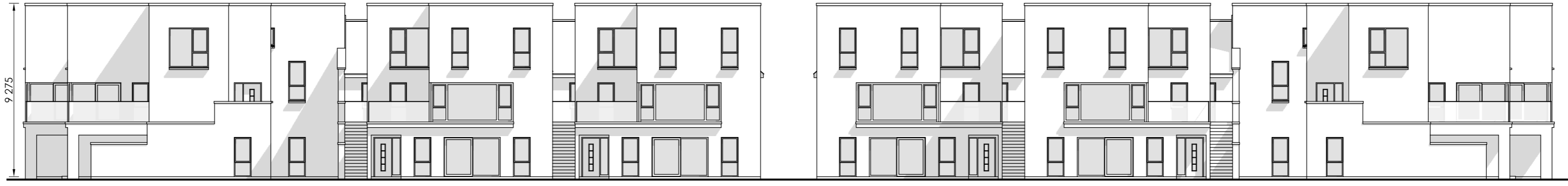
Front [West] Elevation Scale 1:200