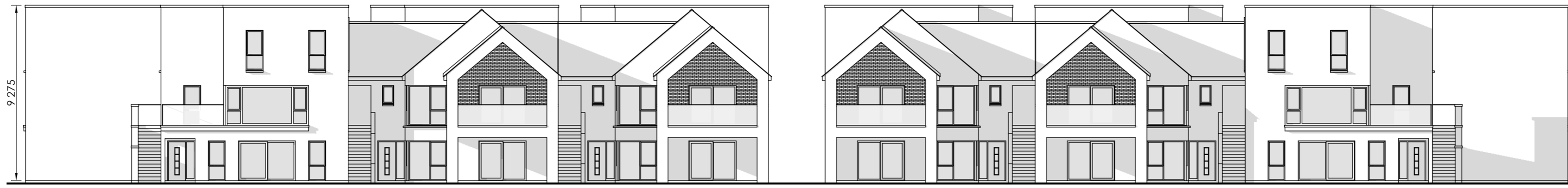
Rear [East] Elevation Scale 1:200